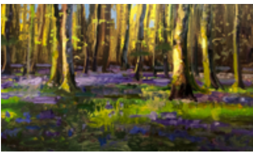
Spring Bluebells by Vincent Crotty

If you have always wanted to learn or revisit how to use a potter's wheel, this is the course for you! Demonstrations and one-on-one instruction help students learn wheel throwing techniques and how to use slips and glazes. See Ceramics Policies online for information regarding studio regulations and safety precautions at New Art Center. Tuition includes 25 lbs. of clay, firing and glazing. All Levels, 12 Tuesdays, 9/12-11/28, 6:00 PM-9:00 PM