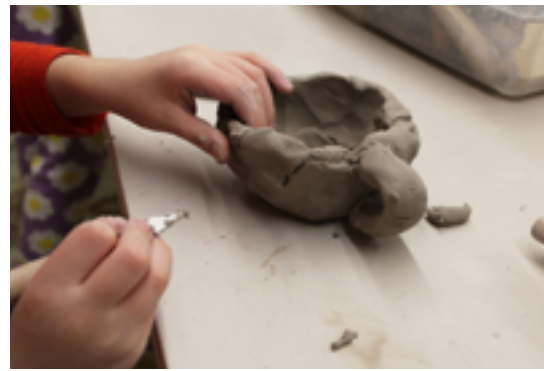
A child plays with clay

All Levels, 9 Fridays, 9/22-12/1, 3:30 PM-4:45 PM, no class 11/10, 11/24 $335