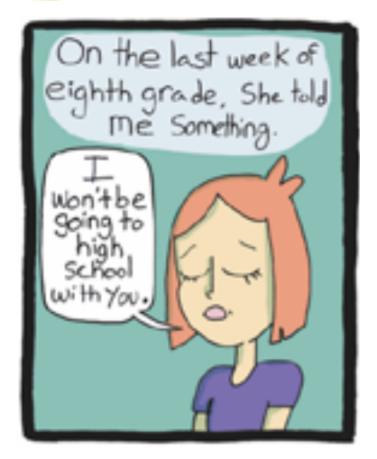
Tell your story in pictures. Mini graphic novel by Liz Young