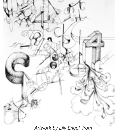
Build your High School Portfolio

All levels, 9 Mondays, 9/18-11/27, 3:30 PM-5:00 PM, no class 9/25, 10/09 $355