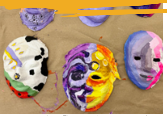
Art as Therapy students created masks to celebrate their identities

Weekly sessions are held on either Mondays from 4:00PM- 5:00PM, or 5:30PM - 6:30PM, depending on group assignments. Groups are led by registered art therapist Erin Palazzolo-Loparo, MS-ATR alongside New Art's Education Coordinator, Sarah Moriarty. Tuition is calculated on a sliding scale ($10-$50 per session) based on household income. Interested students should apply on the website. Accepted students will be contacted and asked to complete the registration process. This program and its facilitators are not performing any diagnostic evaluations/ assessments or acting in the role of a primary therapist or mental health counselor.